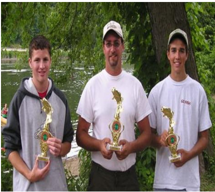
Top Three finishers with trophies