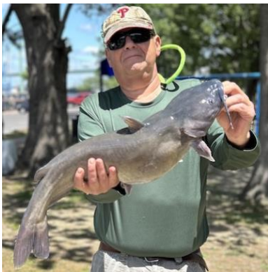
Chick Bay, 2 nd Place