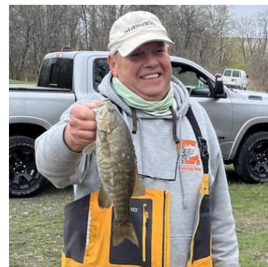
Chick Bay, 10 th Place