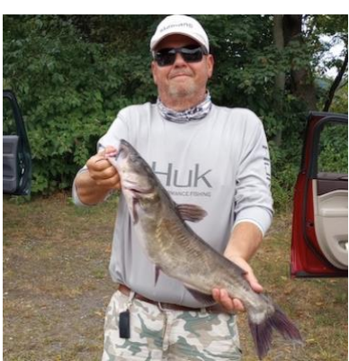
Chick Bay 3rd