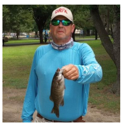
Chick Bay, 7th Place

Check the Tourney Hotline 267-934-2148 for potential changes the day before each DRFA Tournament.