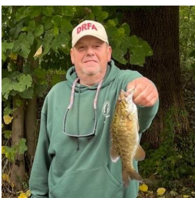
Chick Bay, 6th Place

Get every single DRFA newsletter plus year-round access to the online forum. It's not too early to renew your DRFA membership or help a friend get involved.