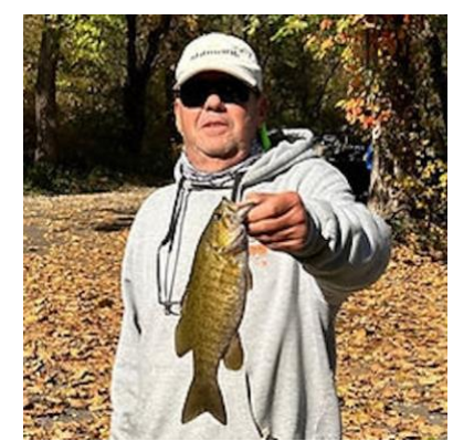
Chick Bay, 6tht Place